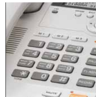
After sales support