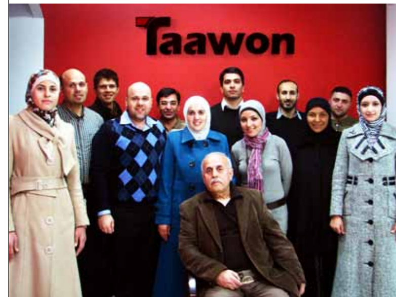
Sales and customer support team at Taawon